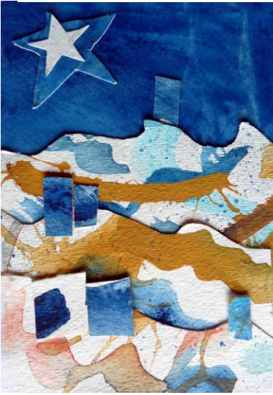
Nwit Silan Nwit Sen Silent Night Holy Night