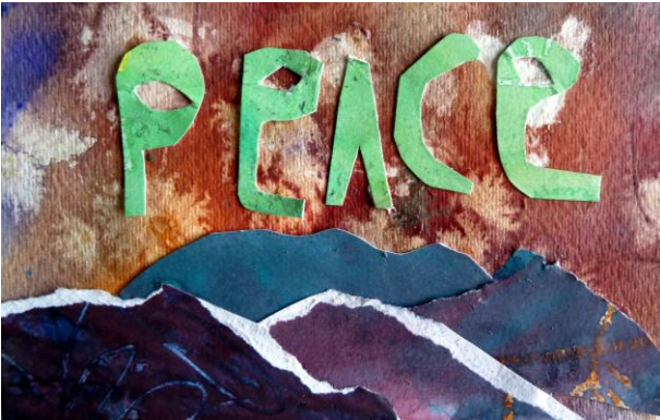
Pè nan Tè